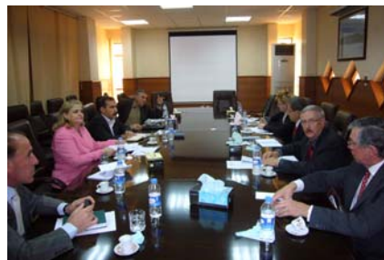
AACCI mission members meet senior members of the Kurdish Region Agriculture Ministry