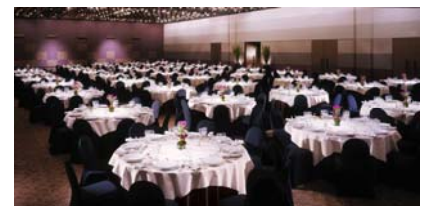
The conference venue – Sofitel on Collins, Melbourne